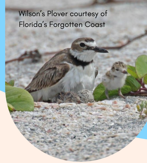
Wilson's Plover