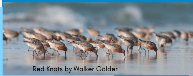
Red Knots