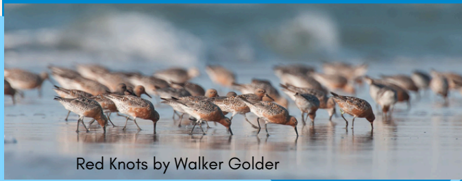
Red Knots

Dogs also increase bird fatalities during spring and fall migration. Because birds view humans and dogs as predators, they waste precious energy flying to escape when you approach, which means they spend less time eating and resting up for their multi-thousand-mile migration.