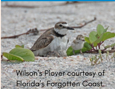
Wilson's Plover

Shorebirds and seabirds view dogs as predators. As friendly as your pup may be, the mere sight of your four-legged friend can cause birds to flee their nests, putting eggs and hatchlings at risk of perishing from heat or predation within minutes. A dog's natural instinct to hunt and chase often directly results in the fatality of shorebirds.