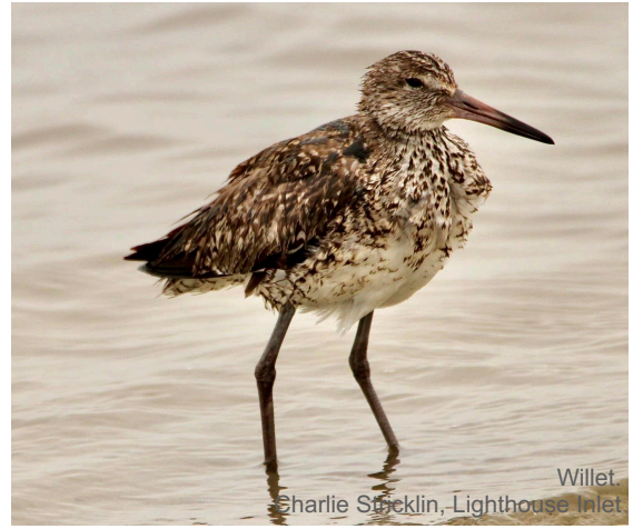
Willet. Charlie Stricklin, Lighthouse Inlet