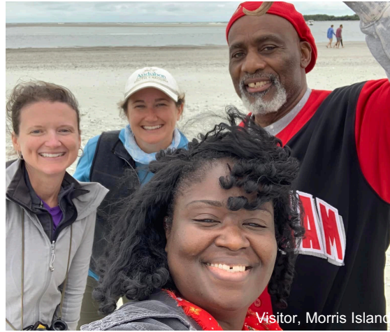
Visitor, Morris Island