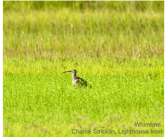
Whimbrel. Charlie Stricklin, Lighthouse Inlet