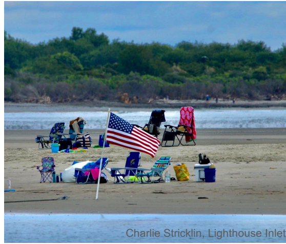
Charlie Stricklin, Lighthouse Inlet