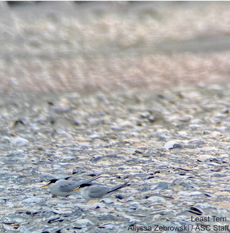
Least Tern. Allyssa Zebrowski / ASC Staff