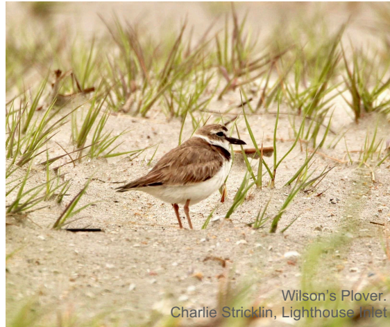
Wilson's Plover. Charlie Stricklin, Lighthouse Inlet