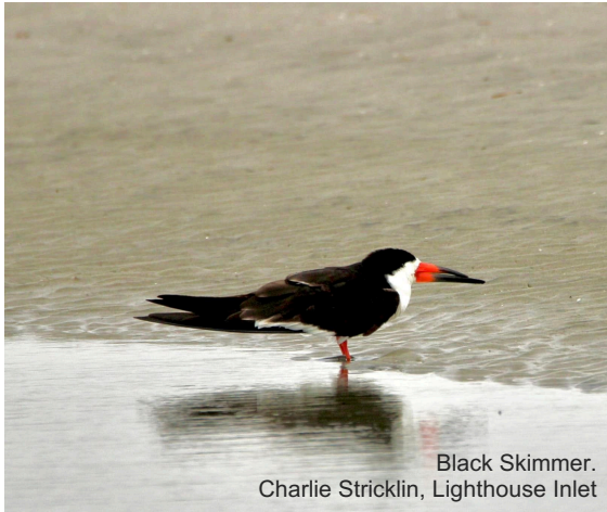
Black Skimmer. Charlie Stricklin, Lighthouse Inlet