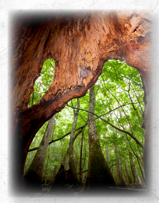
View from inside a hollow cypress tree

The Eastern Big-eared Bat, a species being considered for endangered status, is especially fond of the old-growth portions of the Beidler Forest. One reason Big-eared Bat numbers are so low may be their preference for roosting in hollowed out trees near water. This means a swamp provides an ideal habitat for these animals. Most swamps, however, have been logged and few trees are allowed to get old enough to hollow out. The Beidler Forest, with its great number of ancient cavity trees like this one, may be the "last best place" for the Big-eared Bat.