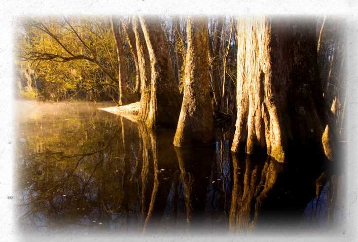
Cypress and tupelo gum on Mallard's Lake

These changes in elevation may appear insignificant, but because of how they affect water depth and the duration of flooding, they make a big difference to the location of plant communities.