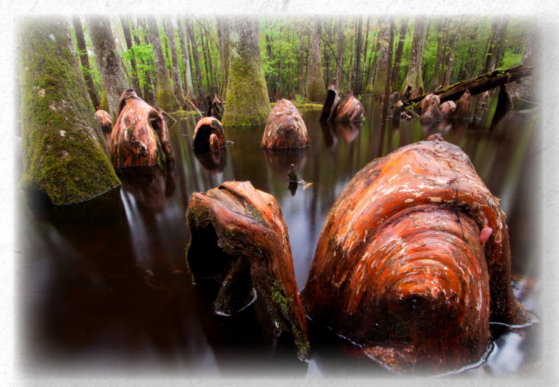
Cypress knees and blackwater along the "Swamp Stomp"

Swamp water levels vary dramatically (as much as 5 feet per year) because the majority of the flow comes from rainfall. This can result in an 18-inch rise in one or two days after an upstream downpour, or a drop of 2 inches per day during a drought. The ONLY thing constant about the water levels in the swamp is that they are always changing!