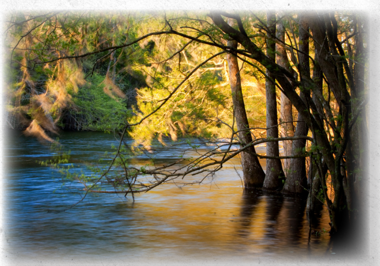
Tupelo Gum at Mallard's Lake

Four Holes Swamp is approximately 60 miles long, originating near St. Matthews, SC and emptying into the Edisto River just upstream from Givhan's Ferry State Park. The swamp encompasses roughly 40,000 acres, but drains nearly 430,000.