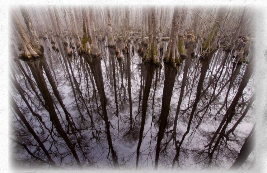
Tupelo gum and bald cypress trees

It just won't do to call every wet place a swamp!