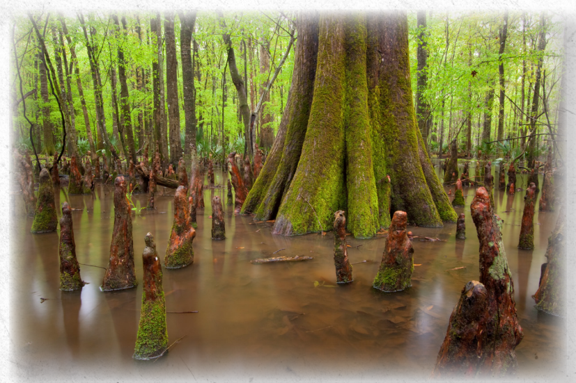
Knees help to anchor the bald cypress during high winds

On the night of September 21, 1989, Hurricane Hugo slammed into the South Carolina coast, packing winds of up to 150 miles per hour. Hugo continued inland with the eye of the storm passing over Beidler Forest early on the 22nd. Much of the damage has now rotted and new, young trees are busy replacing the losses. This huge cypress toppled during the hurricane, taking the boardwalk with it.