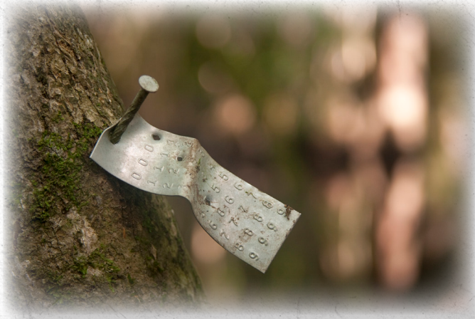
Hugo recovery research tag

The ribbons, stakes, and metal tags visible here mark the location of a Hurricane Hugo research plot. We have recorded information for every tree found on 16 plots located throughout the sanctuary. We have learned how the forest was changed by the storm, and over time, we'll be monitoring its recovery.