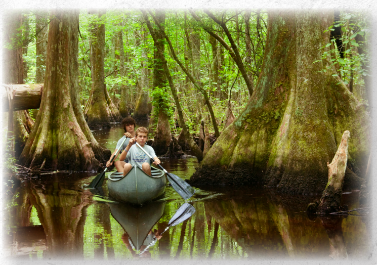
Paddling along the canoe trail

While the boardwalk proves a wonderful way to see the swamp, it is not the only way. Beidler Forest offers a variety of activities and events scheduled year-round including: