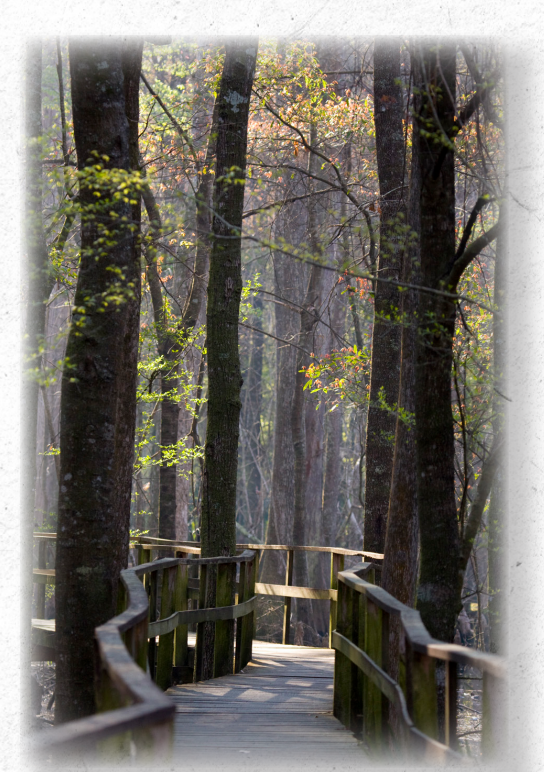
Boardwalk in the morning

The total walk is just over 1.75 miles. There are ten rest stops—two with rain shelters—along the way. Take your time, keep your eyes and ears open, and have a great day!