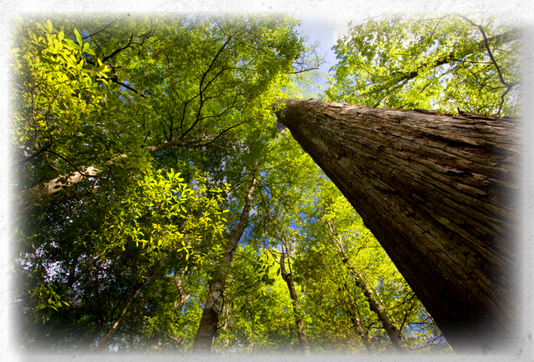
Canopy over the boardwalk

There is no official consensus on how old a forest must be before it can be called "old growth," but it takes several hundred years for a swamp forest like this one to regain its old-growth characteristics and values after a clear cut.